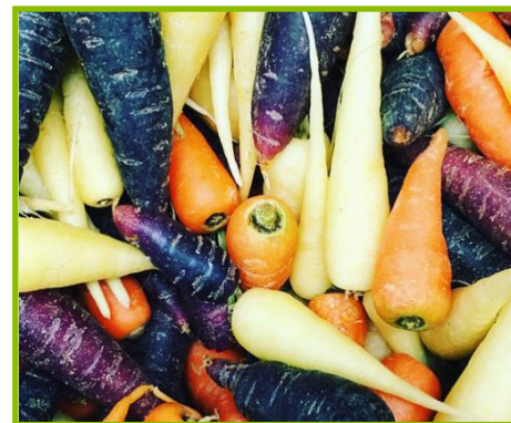
Rainbow Chantenay Carrots

New season Spanish Okitsu Satsumas are now in stock! The South American season is now all but over for all citrus fruits now, the main source is Spain.