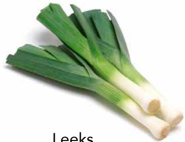
Leeks the national symbol of Wales, use leek with pride!