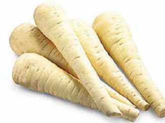
Easter Sunday Veg carrots, roast parsnips, asparagus the list is endless