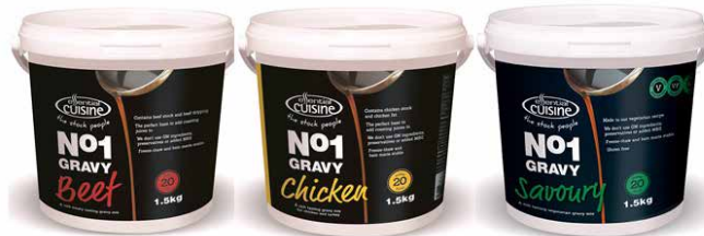
Essential Cuisine Gravy saves you valuable time during the busy weekend