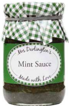
Mint Sauce a must for pouring over lamb