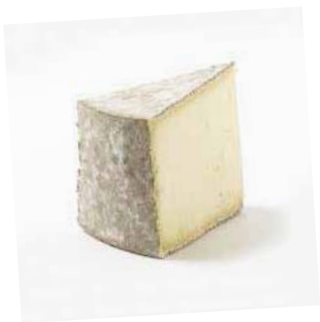
Caerphilly Cheese known as 'the crumbles'

Colliers Welsh Cheddar Powerful Welsh cheddar with a distinctive taste & rich flavour