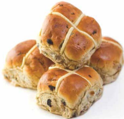
Roberts Hot Cross Buns a Good Friday tradition