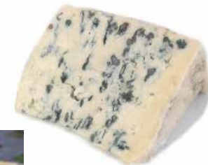
Cashel Blue Ireland's finest blue cheese

Whilst serving Guinness why not offer your customers a range of our bar snacks including, peanuts, smoked almonds and wasabi peas